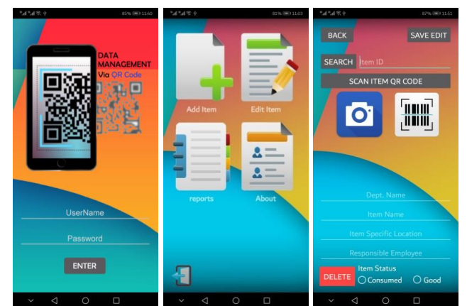
Figure 2. Block diagram for proposed key generation.

The number of application pages has been restricted to five pages, to facilitate the process of controlling and understanding the application, taking into account the utilization of comfortable colors, the sizes of fonts and buttons. See Figure 2.