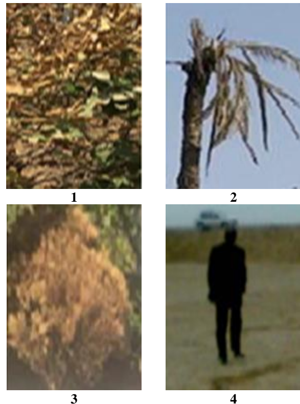
Figure 3: visible evidence of the harsh climate in August 2017 in Baghdad