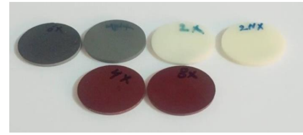
Figure 1: Photographic image Thermal conductivity test specimens.