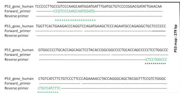
Figure 1: Alignment of Human P53 gene with primers that shows the PCR product size (279) bp.

In this study, the important measurement for us was quantitative Polymerase Chain Reaction (qPCR) technique that used two enzymes: RT and Taq DNA polymerase mixed with sybr dye and other components such as the specific primers targeting to the specific sequences of the P53 mRNA, the results showed that P53 expression depending on the cycle threshold measurement in each samples. The GAPDH gene was used as calibrator for subscription the endogenous expression from each sample. The P53 gene expression of each sample was between 0.1 fold to 0.2 fold compared with the control 0.25 fold (the healthy sample). The highest expression showed was samples seven with 0.2 fold, and the lowest expression showed was samples twenty seven with approximately 0.1 fold that compared with control expression. While the control expression was the highest (0.25 fold) among all patient samples. The results elucidate that tumor may effects on a suppressor gene ( P53 ) and can decrease the gene expression, and eventually can decrease the p53 suppressor protein that can be used it in the cell protection against cancer, or may clear the mutations in suppressor protein ( P53 ) can prevent protection the cell from tumor formation [1].