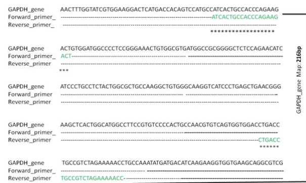
Figure 2: Alignment of Human GAPDH gene with primers that shows the PCR product size (216) bp.